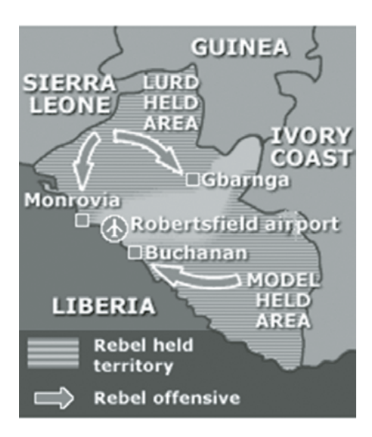
Figure 1. LURD and MODEL Rebels Converge on Monrovia

2003, MODEL expanded from 15 fighters to a force that controlled virtually the entire eastern half of Liberia (figure 1).<sup>5</sup>