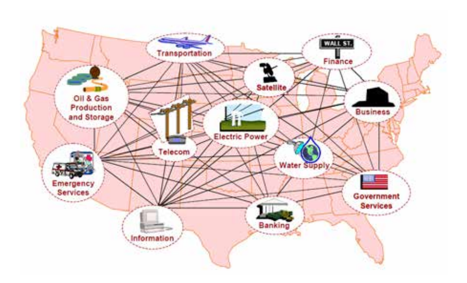
Figure 1: Critical Linked and Interdependent Infrastructures in the United States

The theoretical methodology used to assess the interdependence between critical infrastructures is displayed in Figure 1 below, taken from a study by Gillette, Fisher, Peerenboom, and Whitfield. The diagram demonstrates the links and interdependence between the critical infrastructures, with electrical infrastructure in the center linked to all the others, and all of them dependent on its proper operation.