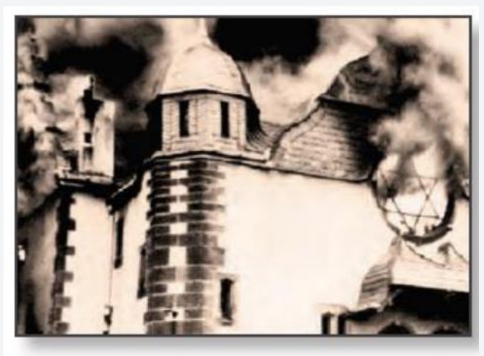
Görsel 2.12: Kristal Gece'de yakılan bir sinagog

genocide (Holocaust) in gas chambers and ovens in concentration camps."<sup>23</sup> While the textbooks do not discuss the persecution of Jews in Turkey during this period, the recognition, albeit limited, of the most significant trauma affecting Jews in modern times is noteworthy.