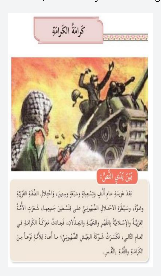
Figure 3. The story of the Battle of Karameh

of prey in the sky." An accompanying illustration at the beginning of the story depicts Israeli soldiers in a tank, shot dead by a Palestinian gunman.<sup>37</sup>