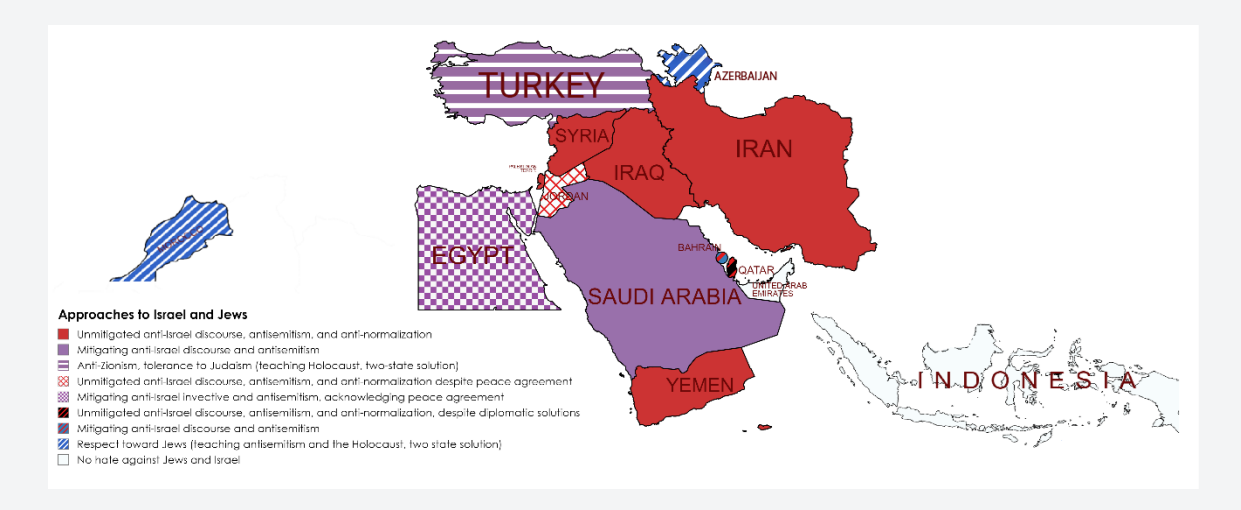
Figure 4. Approaches to Israel and the Jews

Figure 4 demonstrates the major trend lines in the region vis-à-vis Israel and Jews. Whereas red signifies countries with the harshest, most intolerant approach, blue represents countries that have the most tolerant curricula, and purple is for those countries that have a middle way approach. White represents those countries whose curricula have little reference and interest in Jews and Israel, and without noticeable hatred toward them.