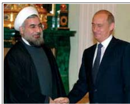
Former Iranian chief nuclear negotiator Hassan Rowhani with Russian president Vladimir Putin

been stopped from – advancing its nuclear program? Equally important, how has it conducted negotiations with the EU-3? Where does it bend and where does it stand firm, and what is the significance in terms of Iran's own leverage over the EU-3 in the negotiations taking place? To what degree has it been able to keep open its options for advancing a military program, even when under increasing pressure? Moreover, Iran's past behavior in dealing with prolifera-