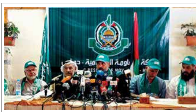
Ismail Haniyeh (center) at press conference with Hamas associates

It thus appears that despite Hamas's impressive electoral performance, the elections