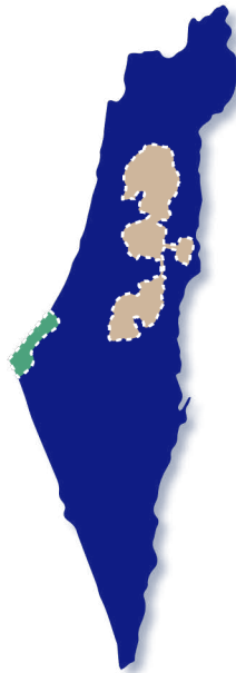
Figure 2. Palestinian autonomy

The main idea: Avoiding the division of the land while preserving the identity of the State of Israel as a Jewish and democratic country and providing the Palestinians with the possibility of self-rule by an autonomous Palestinian government (the Palestinian autonomy) in a defined area within the state.