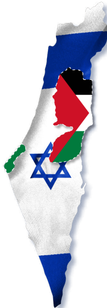
Figure 4. Confederation

The main idea: Each people will have its own state, in which its national identity is realized, while the settlements will be left in place with free movement between the two states. Israel will retain involvement in strategic issues at the confederation level.