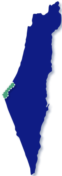
Figure 1. Unitary state

The main idea: Avoiding a division of the territory of greater Israel while preserving the state's identity as Jewish and democratic.