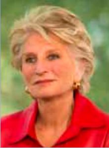
Ms. Jane Harman | Director, President and CEO, Wilson Center

Jane Harman resigned from Congress on February 28, 2011 to join the Woodrow Wilson Center as its first female Director, President, and CEO. Representing the aerospace center of California during nine terms in Congress, she served on all of the major security committees: six years on Armed Services, eight years on Intelligence, and eight years on Homeland Security. Ms. Harman has been recognized as a national expert on the nexus of security and public policy issues. She received the Defense Department Medal for Distinguished Service in 1998, the CIA Seal Medal in 2007, and the CIA Director's Award and the Director of National Intelligence Distinguished Public Service Medal in 2011. She is a member of the Defense Policy Board, State Department Foreign Policy Board, the Director of National Intelligence's Senior Advisory Group, and the Homeland Security Advisory Committee. From 2011 to 2013 she was a member of the CIA External Advisory Board.