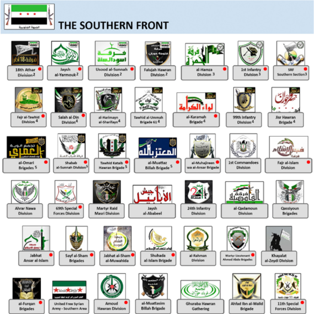
Figure 2: Groups and Units of the Southern Front of the Free Syrian Army