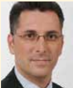
Former MK and Minister Gideon Sa'ar

Fields of Expertise: Arab social media; public opinion in Arab states