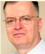
Dr. Shmuel Even

Fields of Expertise: Iran; Middle East regional security; arms control; deterrence