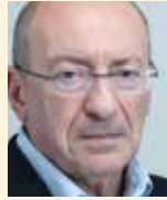
Amb. Zvi Magen

Fields of Expertise: media and public diplomacy; socio-military relations; public opinion