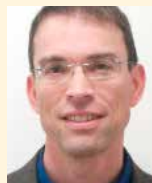
Brig. Gen. Assaf Orion

Fields of Expertise: Israeli security policy; military strategy and doctrine