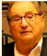
Abraham H. Foxman

Fields of Expertise: US-Israel relations; Europe-Israel relations; China; Jordan; Israel's energy and water resources