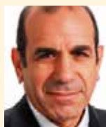
Col. (res.) Gilead Sher

Fields of Expertise: civil-military relations; socio-military relations; ethnic conflicts