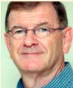
Brig. Gen. (ret.) Meir Elran

Fields of Expertise: deterrence; nuclear policy; arms control; Israeli security policy