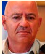
Maj. Gen. (ret.) Yair Naveh

Fields of Expertise: arms control; Iran; nuclear policy and proliferation; Middle East regional security; Egypt