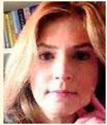
Dr. Zipi Israeli

Fields of Expertise: Turkey; Azerbaijan; ethnic conflicts