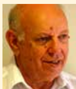
Dr. Ephraim Asculai

Fields of Expertise: Israeli-Palestinian conflict; Middle East regional processes; Israeli security policy; military balance