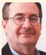
Brig. Gen. (ret.) Shlomo Brom

Fields of Expertise: military technology; low intensity conflict