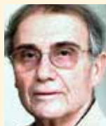
Prof. Gabi Sheffer

Fields of Expertise: international law and national security; legal dilemmas of conflict resolution; Israel's international stature; delegitimization of Israel