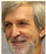
Amb. Shimon Stein

Fields of Expertise: intelligence; cyber security