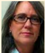
Dr. Emily B. Landau

Fields of Expertise: Israeli-Palestinian conflict; Middle East regional processes; Israeli security policy