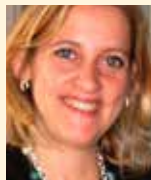
Col. (ret.) Pnina Sharvit Baruch

Fields of Expertise: IDF; military balance; weapons proliferation; Arab military budgets and industries