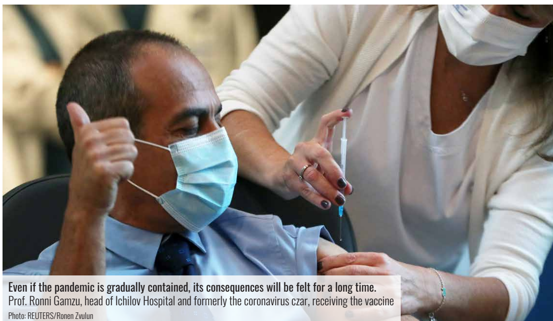
Even if the pandemic is gradually contained, its consequences will be felt for a long time. Prof. Ronni Gamzu, head of Ichilov Hospital and formerly the coronavirus czar, receiving the vaccine

As part of Israeli society, the Arab public and its leaders were mobilized for the struggle against the pandemic, and medical personnel from Arab society have stood at the forefront of the national effort against the virus. Initially the sector acted as a collective, cooperating with the government ministries and security forces, and weathered the first wave of the pandemic with low morbidity. However, since the second wave the situation has deteriorated, with the percentage of Arabs infected by the disease double their percentage in the population. The causes were growing indifference among the Arab public, coupled with economic hardship, lower state provisions, and a continued wave of violence and crime.