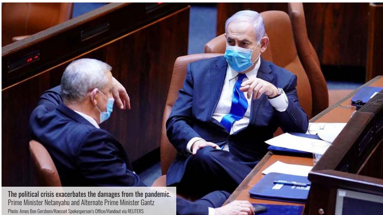
The political crisis exacerbates the damages from the pandemic. Prime Minister Netanyahu and Alternate Prime Minister Gantz

The characteristics of the crisis in Israel and the ways it has been managed are similar to those in other Western democracies. Yet two interrelated areas have aggravated the damage in Israel: the prolonged political crisis, and the high degree of centralization of the already weak public institutions.