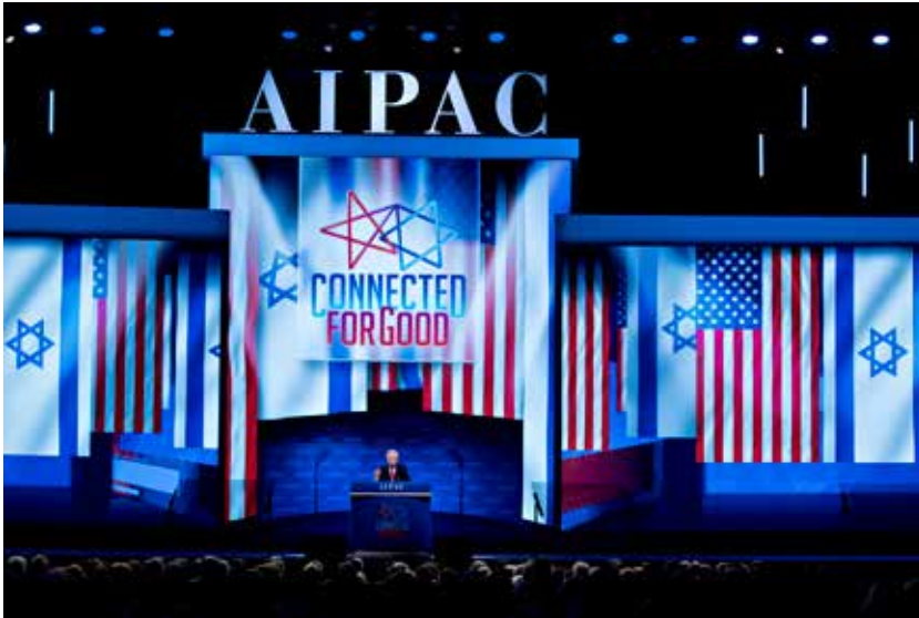
Senate Majority Leader Mitch McConnell (R-KY) at the AIPAC Policy Conference in Washington, D.C., March 26, 2019.