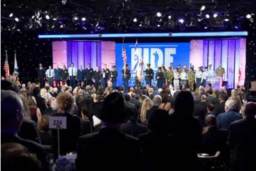
Friends of the IDF Western Region Gala, Beverly Hills, California, November 3, 2018.