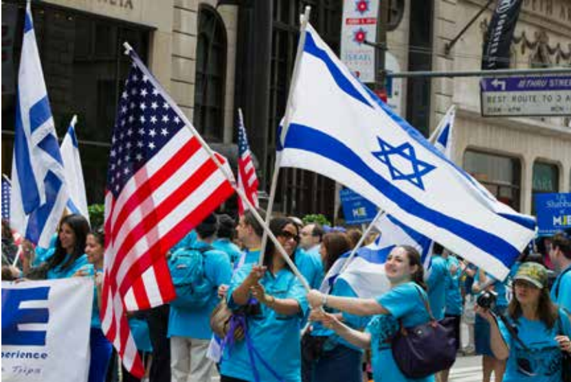
Celebrate Israel Parade in New York City, June 5, 2011.

Our impression is that official frameworks of dialogue suffer from multiple shortcomings. To this end, we propose a variety of possible formats: